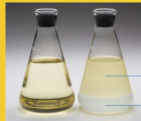
GASOLINE AFTER PHASE SEPARATION