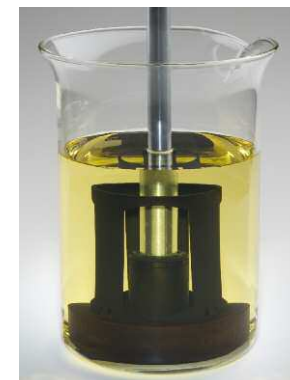
PHASE-TWO IN CLEAN GASOLINE