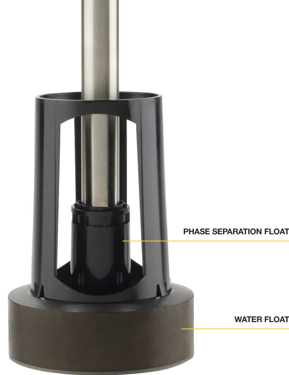
PHASE SEPARATION FLOAT