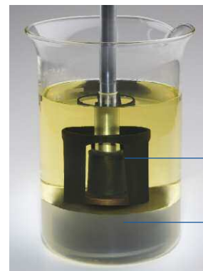
PHASE-TWO DETECTING PHASE SEPARATION

The first and only solution to continuously monitor and detect phase separation in an underground storage tank.